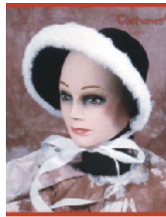
Bonnet - Costumes4less $16