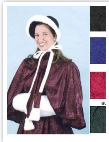
Victorian capelet - eBay $25