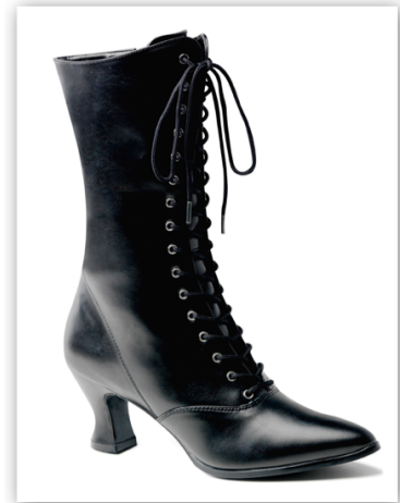
Variety of boots - Amazon $35 & up